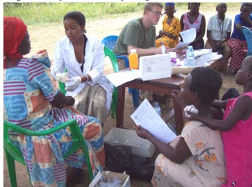
Voluntary counseling and testing session in Busukuma

RWEYOWA has been running this activity in close collaboration with partner organizations especially Mildmay Uganda and Bunamwaya Teenage Centre (BUTEC). At the beginning of the calendar year 2009, RWEYOWA launched a new program whereby VCTs were conducted at RWEYOWA offices in Namasuba. Other sessions have been carried out in different communities of Ssabagabo Makindye Sub-county. Areas outside Ssabagabo have also accessed this service on request. We look forward to acquiring enough testing kits to respond to all requests for VCT in the community