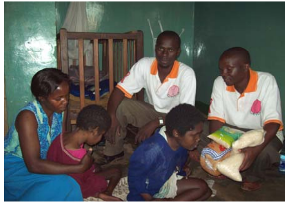
Reaching out to RWEYOWA clients through community outreach