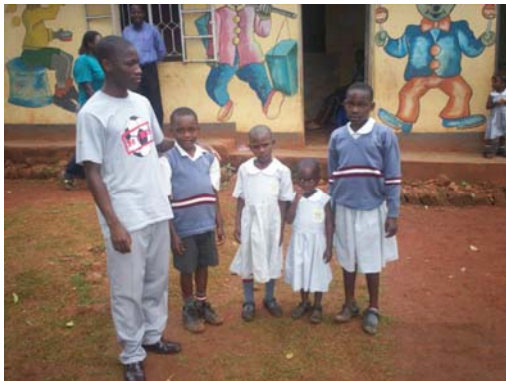
Program Director with some of RWEYOWA's sponsored orphans at Namasuba Parents' School

RWEYOWA has continued to provide sponsorship in the endeavor to improve the livelihoods of vulnerable orphans affected/infected with HIV/AIDS in the community. This is as a result of the wonderful partnership with the local primary schools which provide RWEYOWA with full and half bursaries for orphans to access primary education. These schools include Namasuba Parents' School, Born to Win Primary School, St. John Primary School and Step Up Primary School. In this calendar year 2009, some of the orphans under RWEYOWA's sponsorship program will sit their primary leaving examinations.