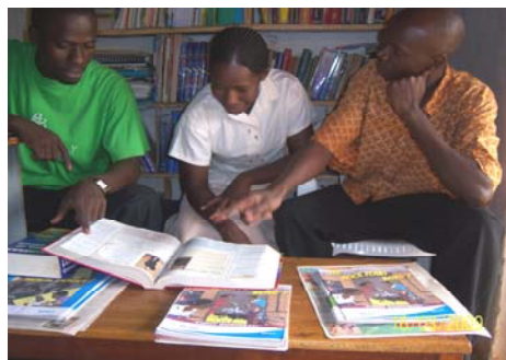
RWEYOWA staff making use of the the resource centre/library

In this implementation year under review, RWEYOWA launched its Web site: www.rweyowa.org and this was aimed at raising awareness about RWEYOWA's activities worldwide. A resource centre/library has been established and is booming with the support from Book Aid International, Children International and the National Library of Uganda. It is the only community resource centre/library in our local area and is stocked with a wide range of information on HIV/AIDS and other related health issues, textbooks, and works of fiction and non-fiction. The resource centre is serving not only local students, but also the community at large as well as the RWEYOWA staff.