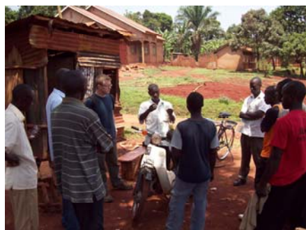
Boda-boda cyclists being sensitized on condom use in Busabala