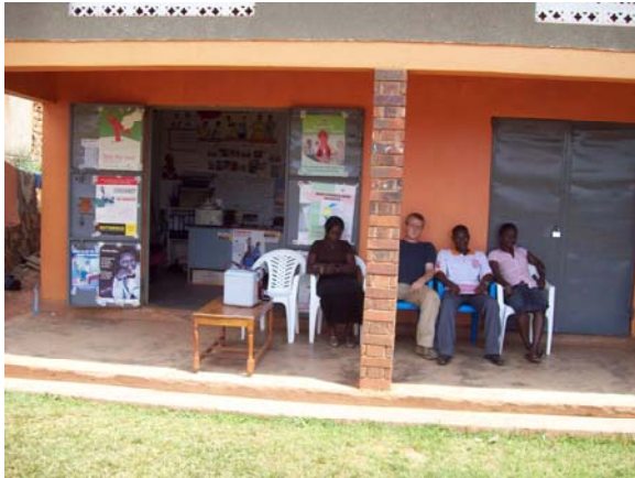
RWEYOWA office in Namasuba

Since its inception, RWEYOWA has been implementing core interventions like community outreach, comprehensive HIV/AIDS awareness and sensitization/education, voluntary counseling and testing for HIV, vocational skills training, condom promotion and distribution to at-risk populations, and orphan support activities.